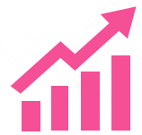
Detailed HR reporting