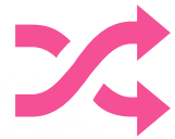
Workflows, calendars and email reminders