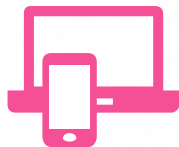
Track company property