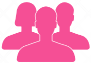
Org chart and position management