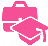
Training and education