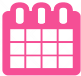
Date-driven employee events